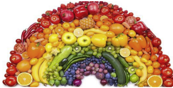
Encourage your child to eat a rainbow of fruits and vegetables.